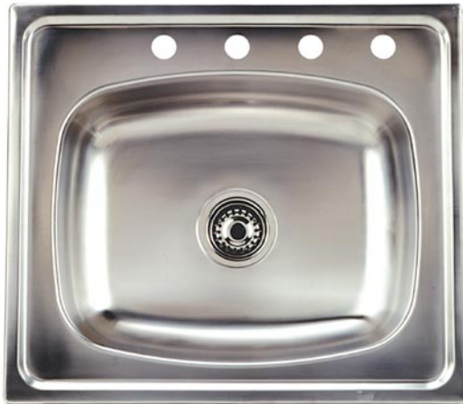
Model # 258-413