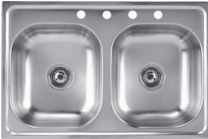
Model # 398-413