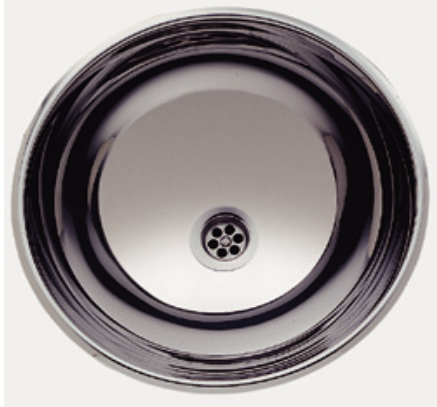
Model # 130-002